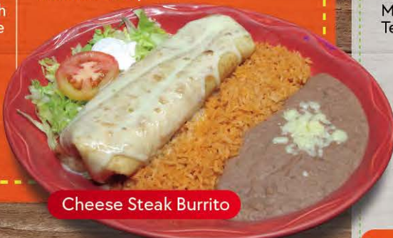
Cheese Steak Burrito

Crazy Burrito 7.99 Flour tortilla filled with chicken or ground beef. Smothered with rice and cheese dip