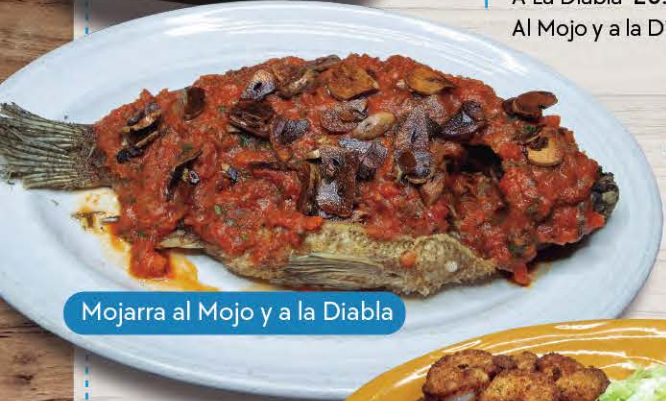
Mojarra al Mojo y a la Diabla