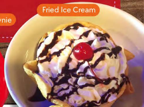
Fried Ice Cream