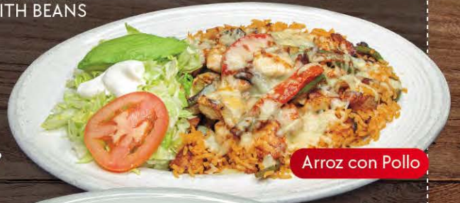
Arroz con Pollo