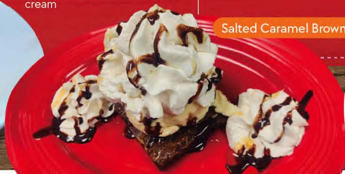
Salted Caramel Brownie