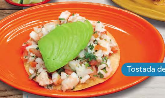
Tostada de Ceviche