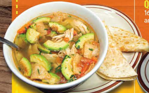
Chicken Soup and Quesadilla

Lunch Chicken Soup and Quesadillas 8.99 16 oz. bowl of our famous chicken soup and two small cheese quesadillas