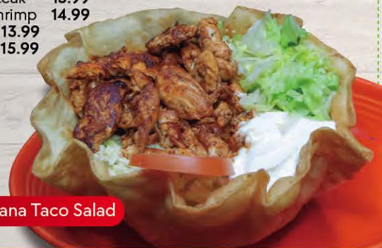
Tijuana Taco Salad

Grilled Chicken 12.99 Grilled Steak 13.99 Grilled Shrimp 14.99 Mixed 13.99 Texasas 15.99